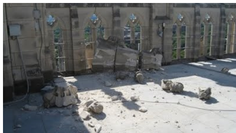
The earthquake caused damage to the Washington National Cathedral, causing one of the spires to break.

PRO-telligent headquarters was shaken up this August when a 5.8-magnitude earthquake hit the Washington DC metro area. The epicenter was traced to approximately five miles from Mineral, Virginia, a small town in the central part of the state, and just 80 miles from PRO-telligent's headquarters in Arlington, Virginia. Occurring at 1:51 pm, the earthquake made short time rattling up the East Coast, taking less than a minute to be felt as far North as New Brunswick, Canada.